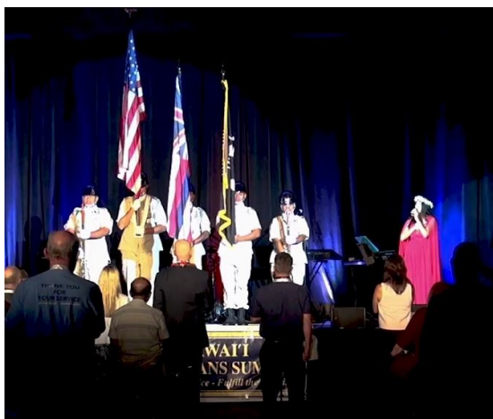
Photo Left: The Hawaii Youth Challenge Academy Cadet Color Guard presents the colors at the start of the Veterans' Summit on 21 June, 2019.