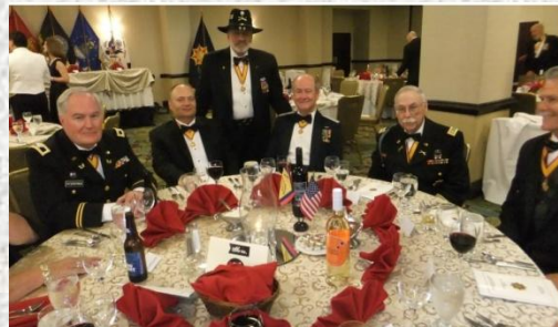
Rhode Island Delegation