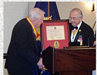
Hon. Ed Meese receives DSM