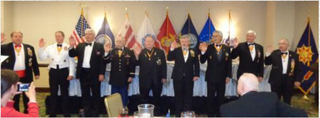
Swearing-In of our National Officers