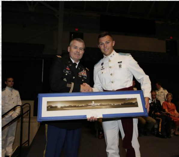
General Charles P. Summerall Award for 2017