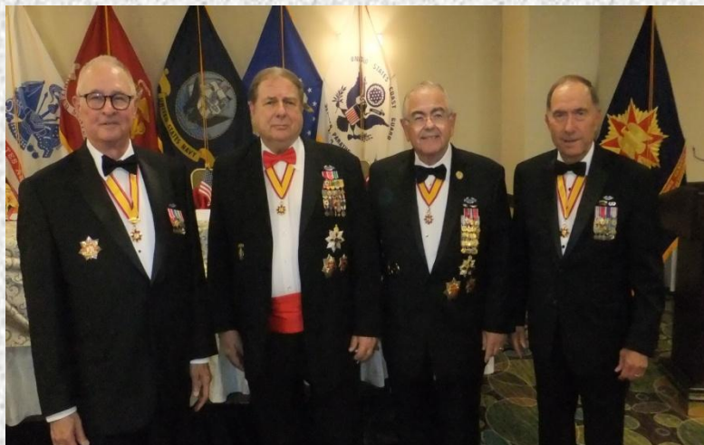
Below from left to right are: